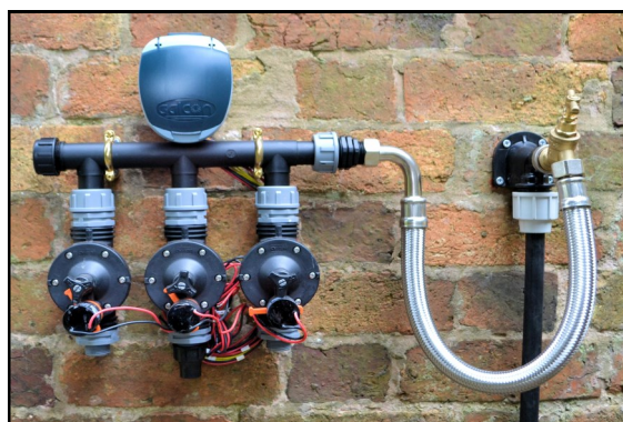
GALCON TAP MANIFOLD (up to 4 zones)