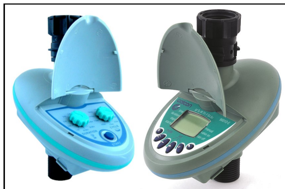
Single Station Controllers - EPAGD/T

Crick, Northampton NN6 7XS 01788 823811 sales@access-irrigation.co.uk www.access-irrigation.co.uk