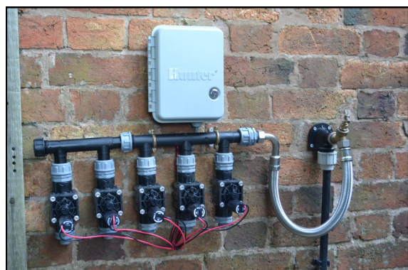
HUNTER TAP MANIFOLD (up to 12 zones)