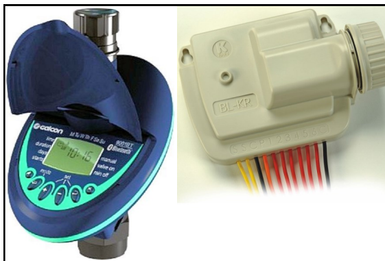
Bluetooth Controllers - EPAGBT/EPAY04