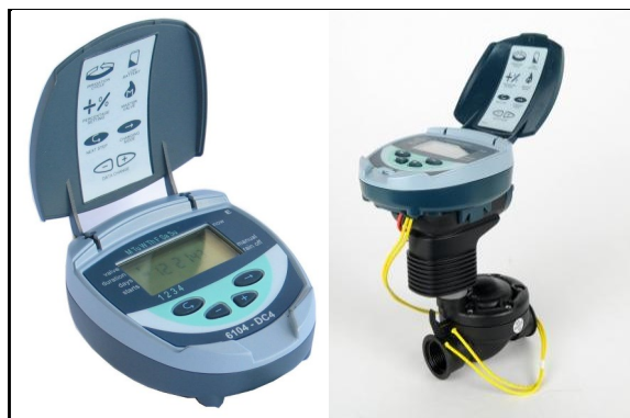
Multi-Valve Controllers - EPAG01/DC4