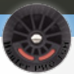
PRO-SPRAY FIXED ARC NOZZLES