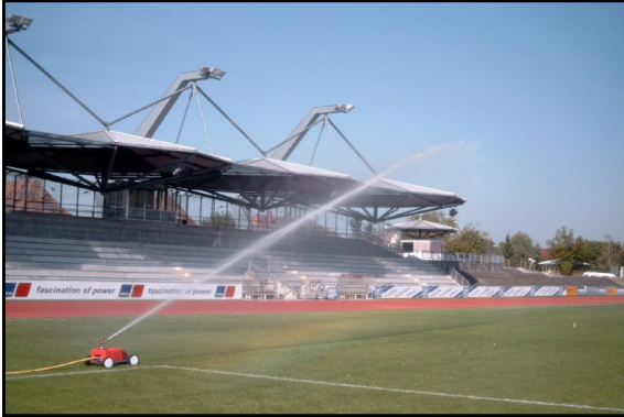
Travelling sprinkler in operation—cover not included