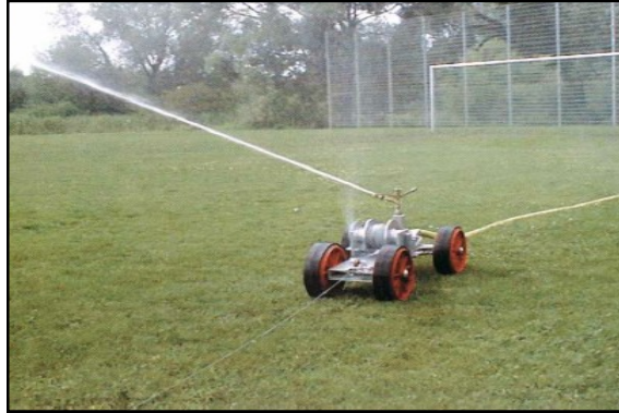
Rega 4 wheel sprinkler