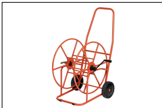
Metal hose trolley