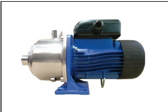
Lowara e-HM pump