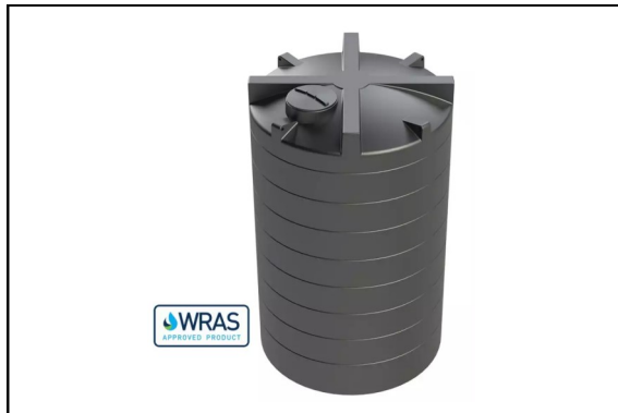
WRAS approved 20,800 litre storage tank