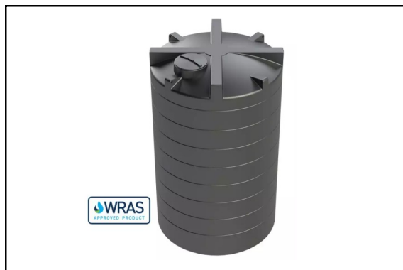
WRAS approved 5,000 litre storage tank (10,000 litre option)