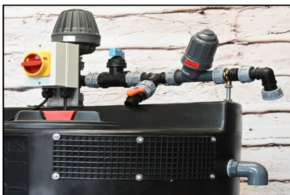
Type 'AB' air gap